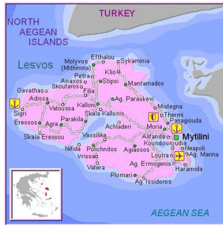
Map of Lesvos

Feel free to get in touch with Didi at 289.228.5293 didi.dances@yahoo.ca