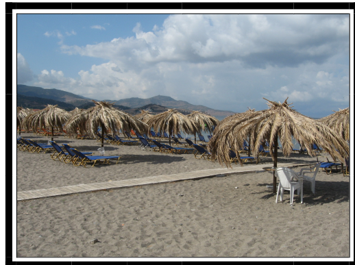
Petra Beach .....the best sunset on the island

The 'Glorious Greece Getaway' Nia Retreat approx. $1499.00 CDN