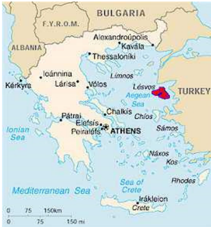
Map of Greece

Warning: This weeklong Nia Retreat may cause a desire to return to the island of Lesvos often and create even more lifelong memories.